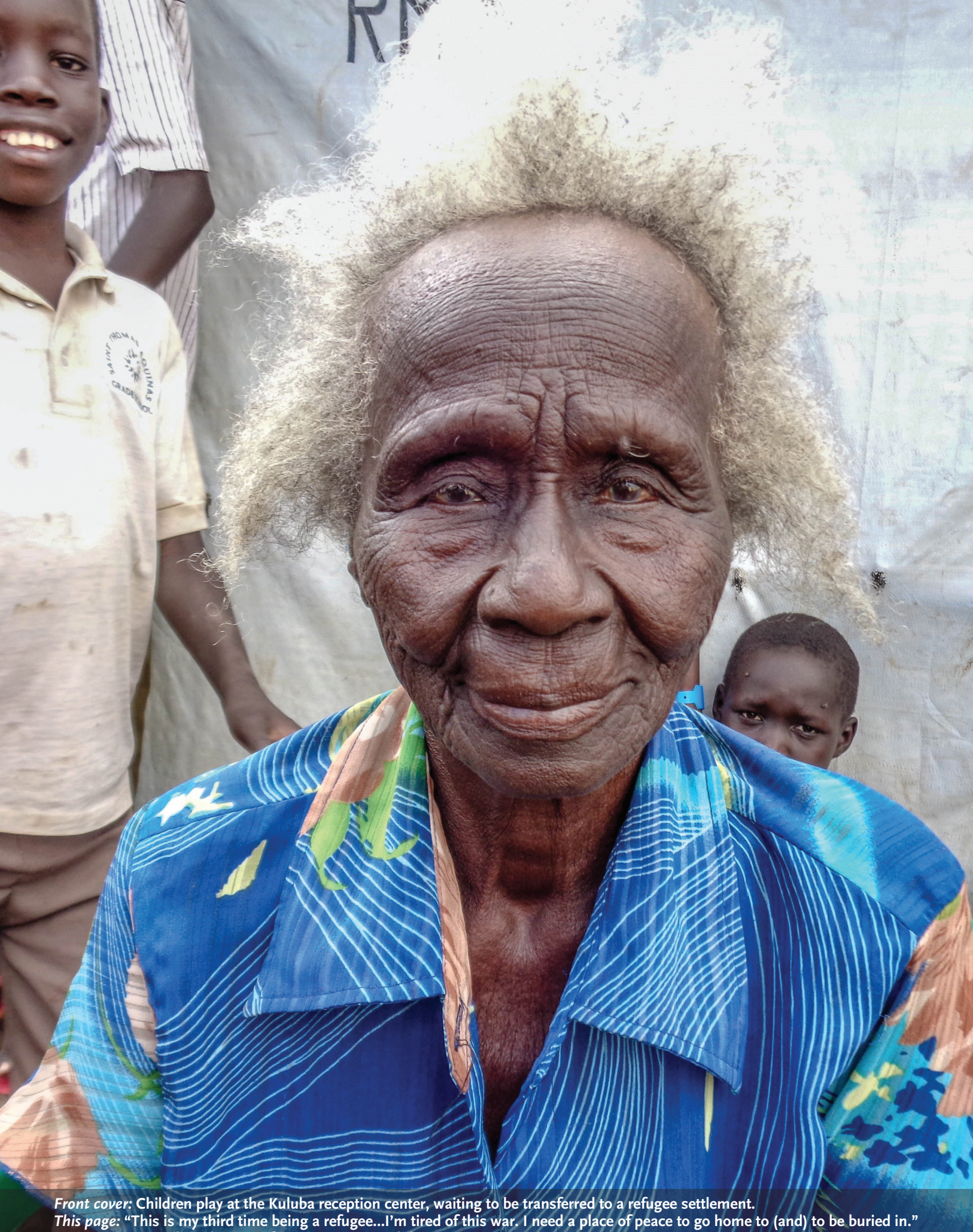
Front cover: Children play at the Kuluba reception center, waiting to be transferred to a refugee settlement. This page: "This is my third time being a refugee...I'm tired of this war. I need a place of peace to go home to (and) to be buried in." — South Sudanese refugee woman at Kuluba reception center